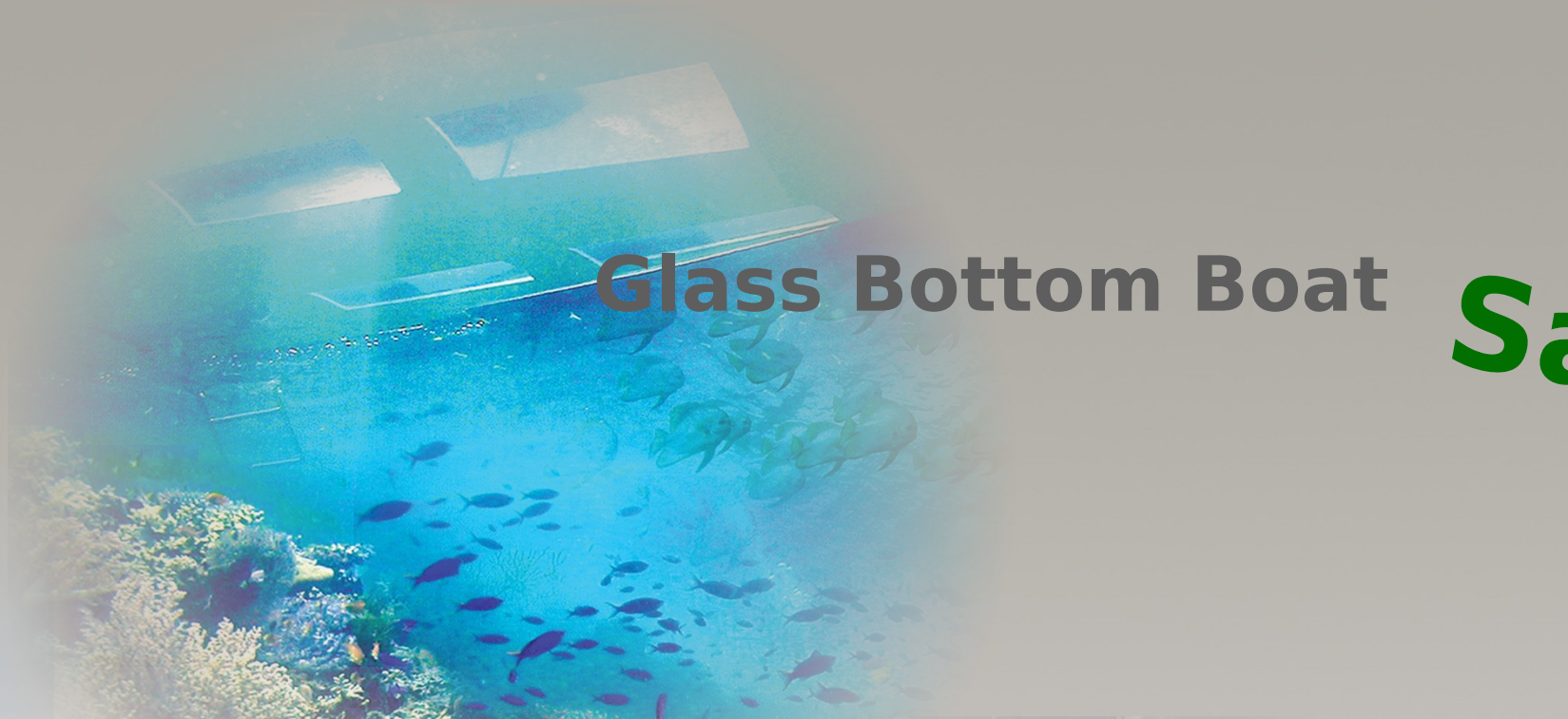
Glass Bottom Boat